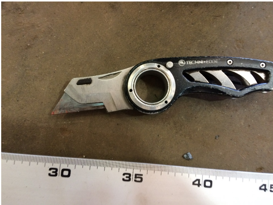
Knife used during injury